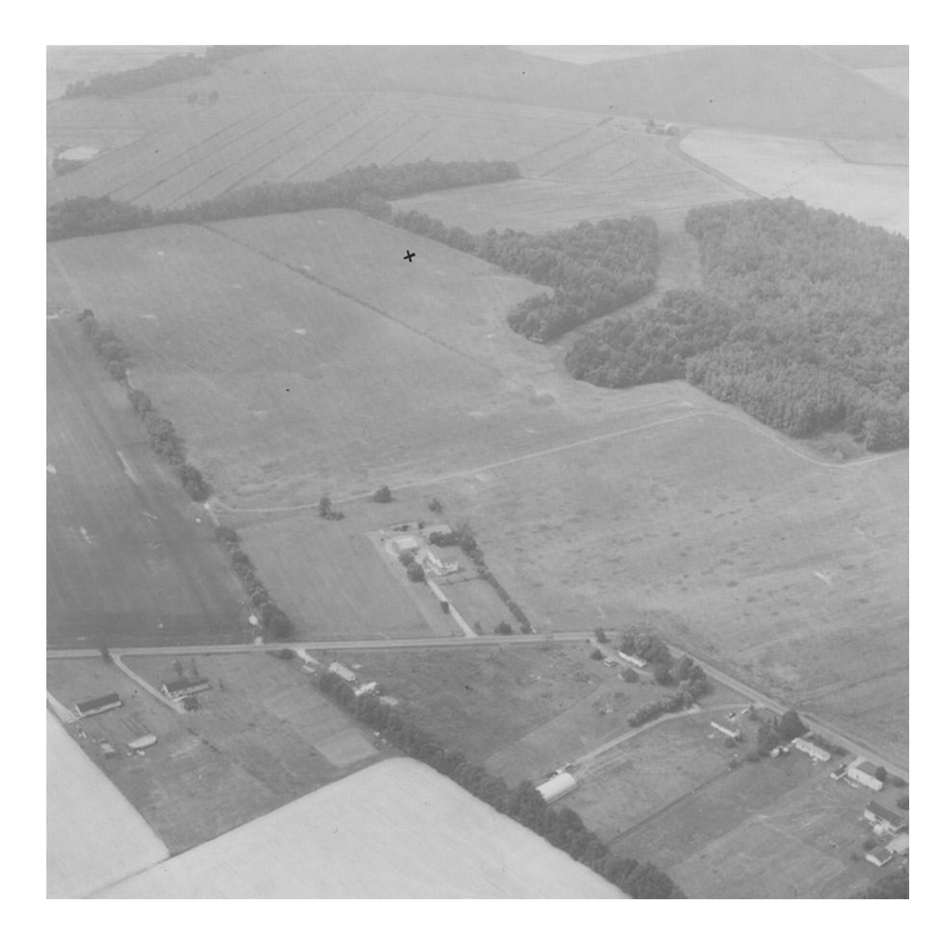
Plate 5 Project area

View of the project area from the air, looking south; the site is indicated by the crossmark. The road follows the north line of Bloomsbury as it existed after Axell sold the north part. The rectangular yard in center foreground contains the farmyard, as established by Abraham Allee before 1857.