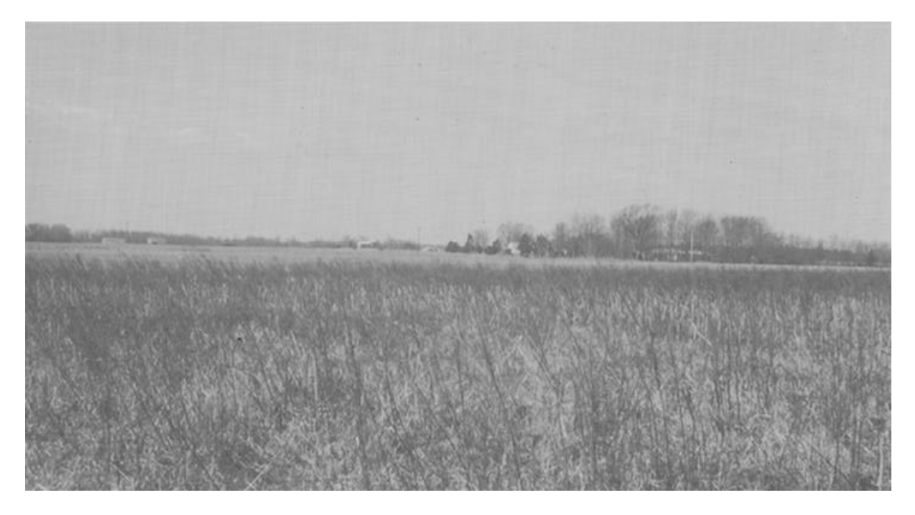
Plate 3 Flatlands

From ground level, the Delaware coastal plain sometimes appears to be a featureless expanse of flat land. This relative absence of relief frustrates the work of archæologial surveyors, who seek landforms that were hospitable to past inhabitants.