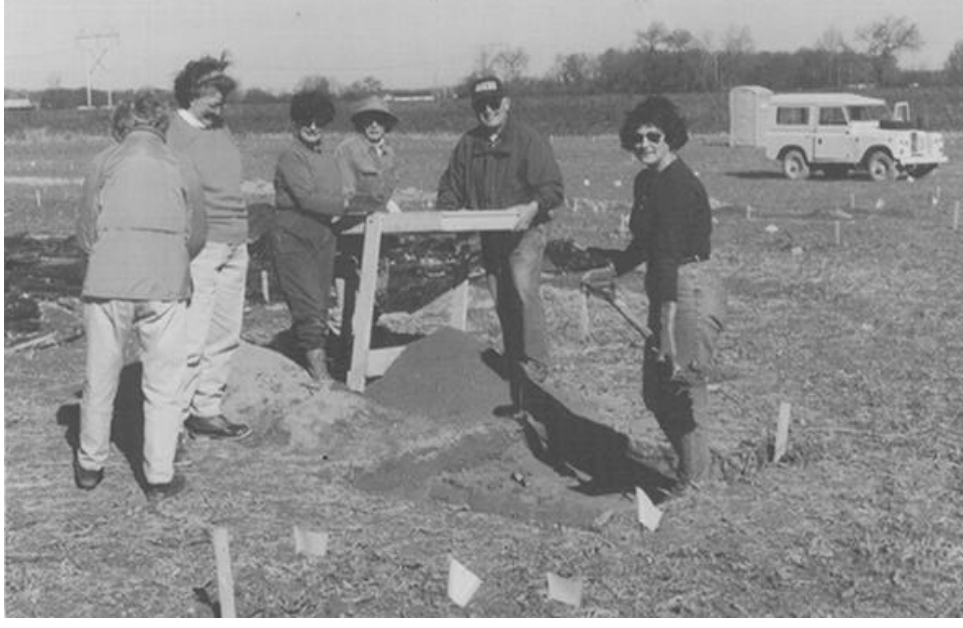
Plate 4 Volunteers

Kent County Archæological Society members on the site, November 1994.