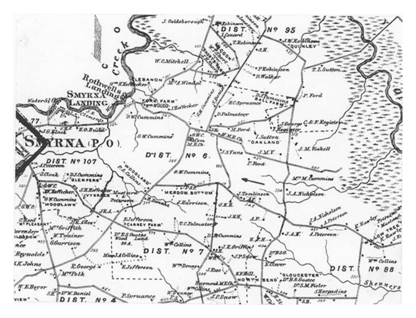
Figure 7 Detail of Beers Atlas , 1868. Arrow indicates project area

is there. If a site should be found outside the area of high expectations, it does not necessarily disprove the model. Instead, studies of such anomalous locations merely contribute to our understanding of the model.