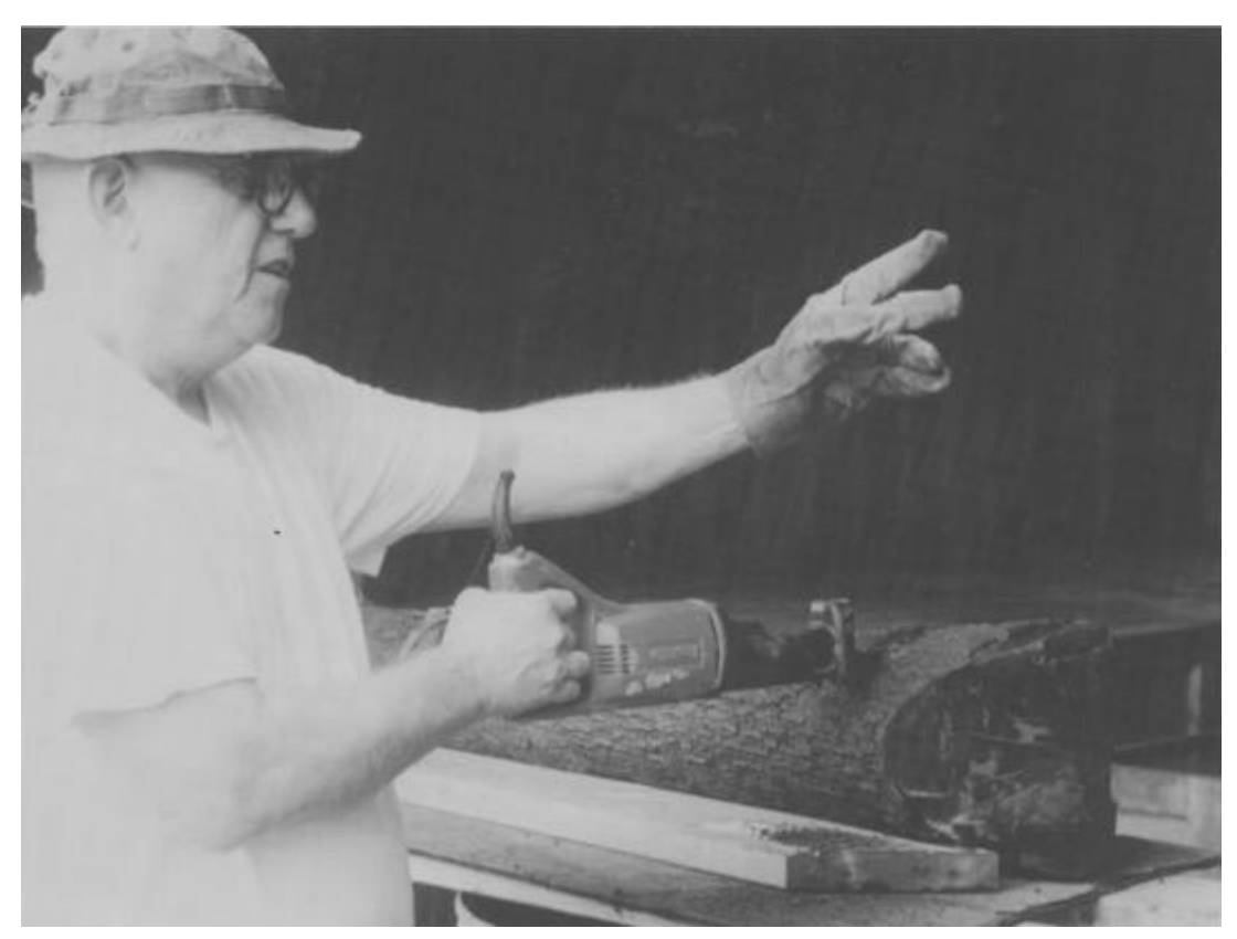
Plate 37 Scientific sampling of a log

Dr. Heikkenen removes a sample from the inserted log from the east well with a reciprocating saw.